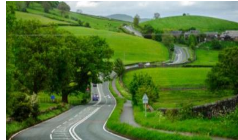
rural - places that are far away from large towns or cities