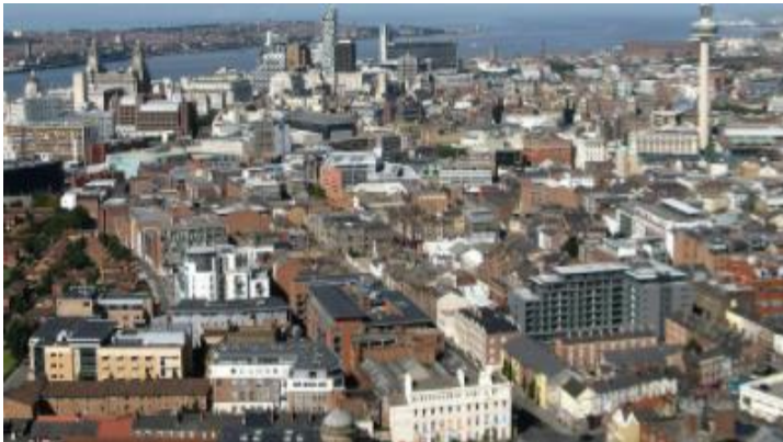
urban - belonging to, or relating to, a town or city