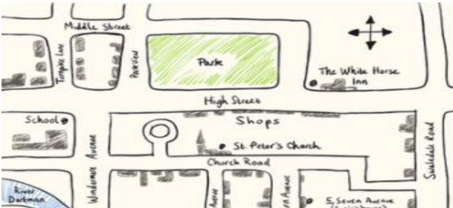
Sketch map - a map drawn from observation and representing the main features of an area