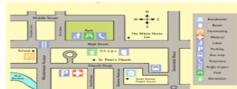
Key - the key on a map or diagram is a list of the symbols used and their meanings