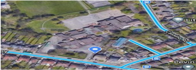
aerial view- looking directly down on an area