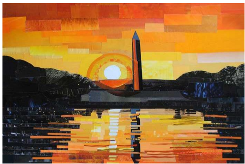
Washington Monument at Sunset