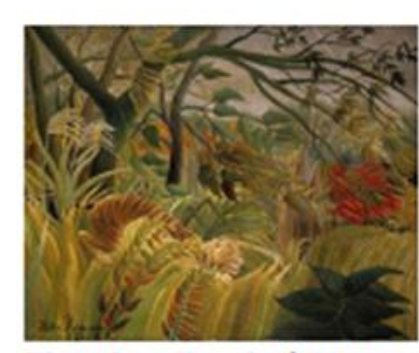
Tiger in a Tropical Storm