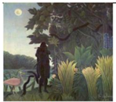
The Snake Charmer