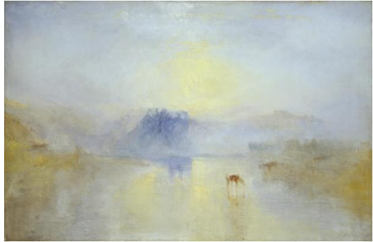
Norham Castle, Sunrise