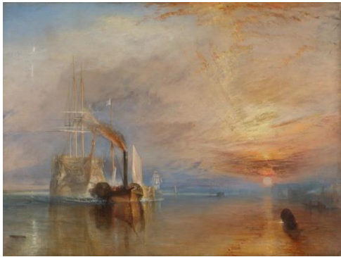
The Fighting Temeraire