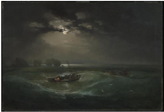
Fishermen at Sea