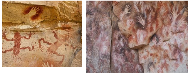
Cuevas de las Manos (Cave of the Hands)