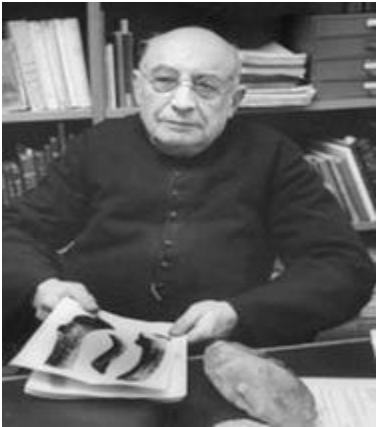
Henri Breuil Born: 1877 – 1961

French archaeologist famous for his studies of prehistoric cave art, such as that discovered at Lascaux and Altamira.