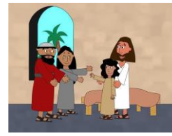
Jairus' daughter. Mark Ch 5