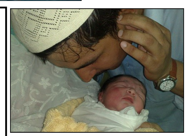
Welcoming ceremony from other faiths: First haircut, words, tastes

Christening: a naming ceremony Vicar/Minister/Priest: the church leader who baptises Godparents: adults chosen to support/pray for a child Water: symbol poured onto the person being baptised Belonging: joining together with others