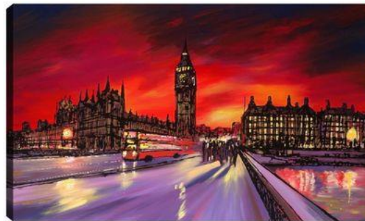
From Westminster bridge