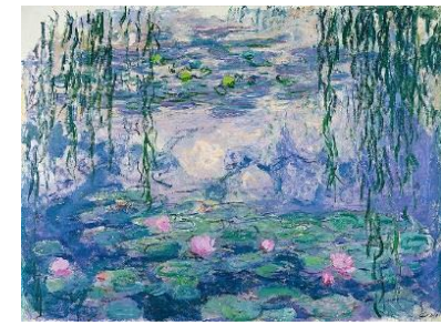
The Water Lilly Pond