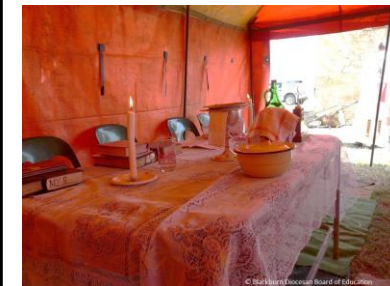
South African Eucharist