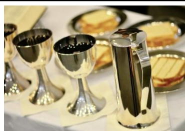
Chalice and Paten