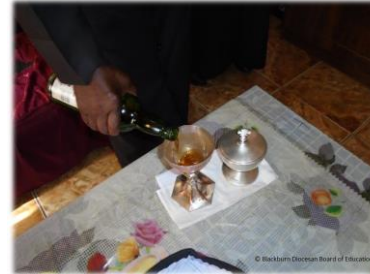
Communion at Home

24 'This is my blood of the covenant, which is poured out for many,' he said to them. 25 'Truly I tell you, I will not drink again from the fruit of the vine until that day when I drink it new in the kingdom of God.'