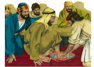
The Last Supper