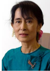
Aung San Suu Kyi